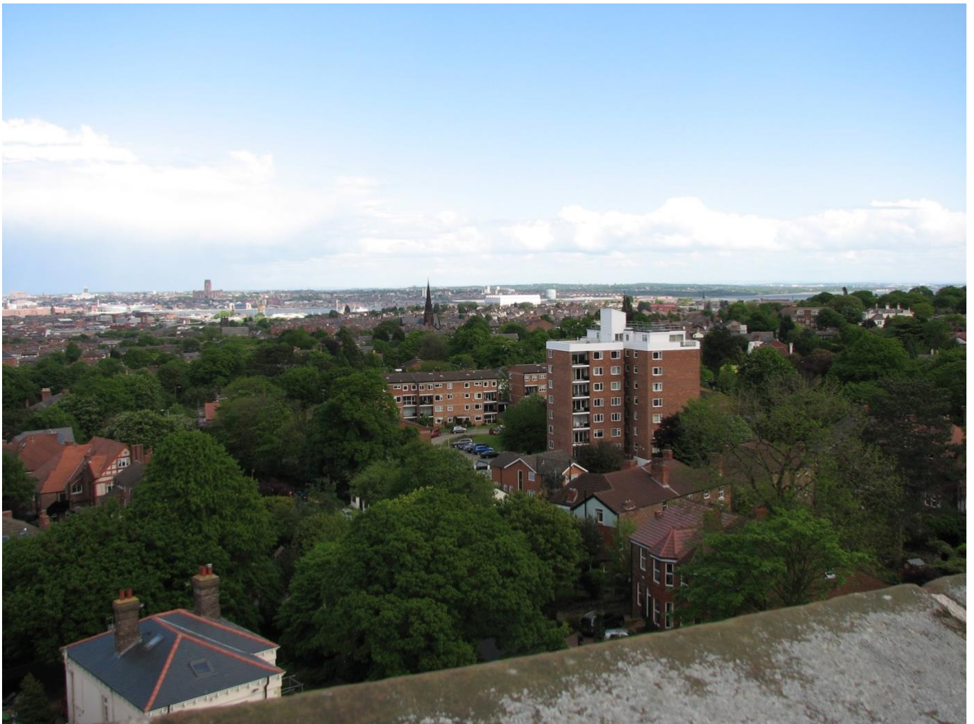
The view Eastward from our Church Tower. Visible are: The Metropolitan Cathedral of Christ The King; Liverpool Anglican Cathedral; The River Mersey; Cammell Laird Shipbuilders; the leafy canopy surrounding Oxton Village.

A large finance committee works with the Treasurer to oversee parish finances and reports regularly to the PCC. There is a separate fund-raising Committee.