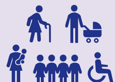
Wider Mission & Outreach

Thanks to your support, in churches across our Diocese: