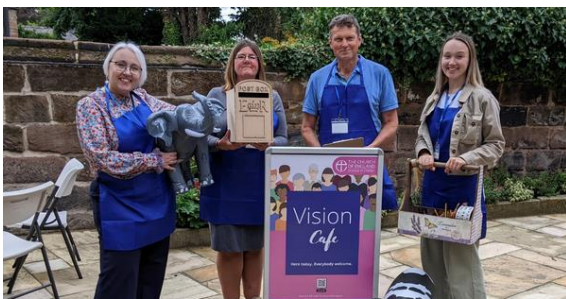
The first Vision Cafe event was held in Grappenhall in September

The responses and contributions are being collated and a team made up of senior staff, including the three bishops, will review the responses before discerning what should be the key priorities and strategic aims for the Church in the Diocese of Chester.