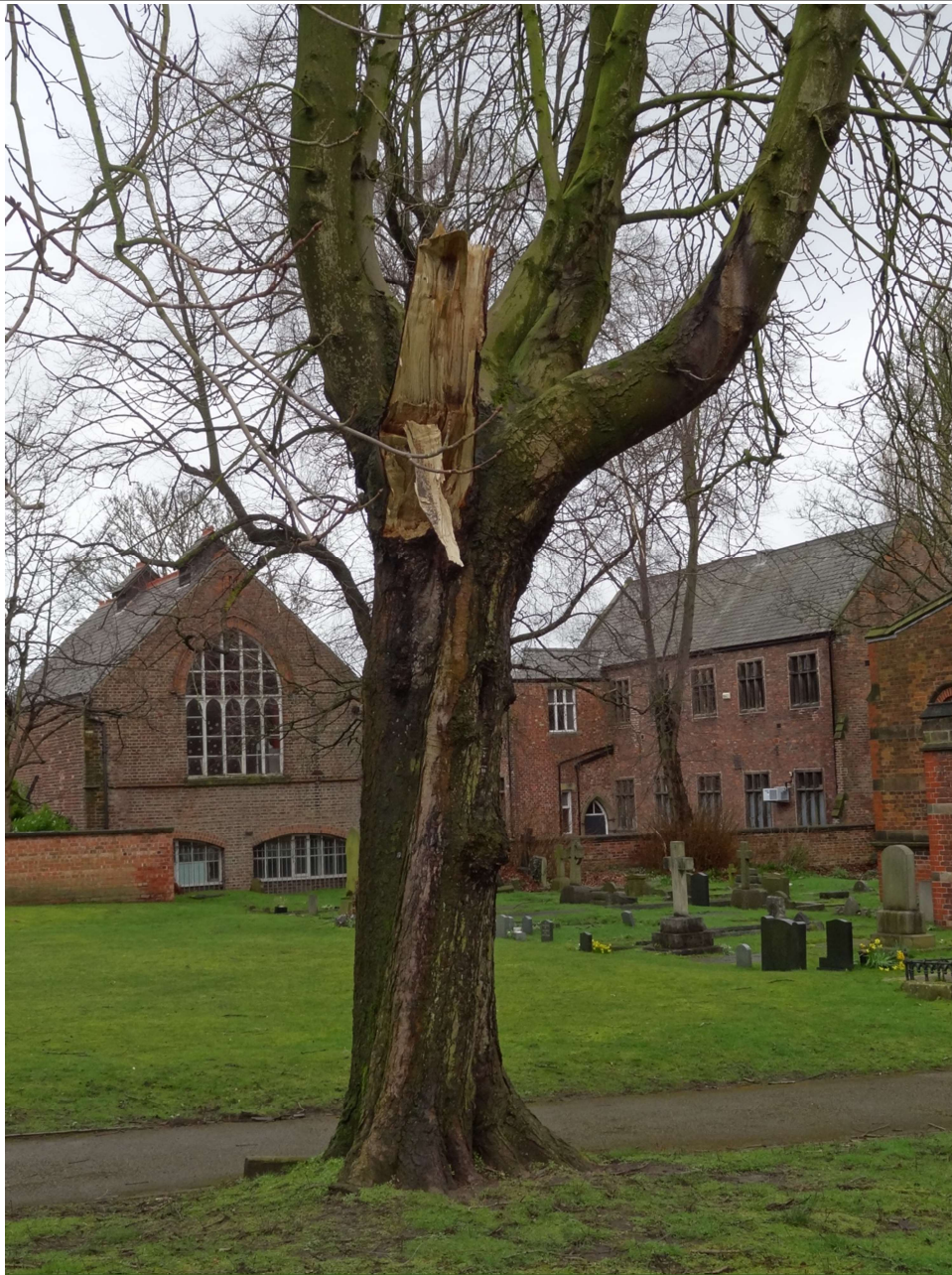
Storm-Damaged Tree, showing Scar