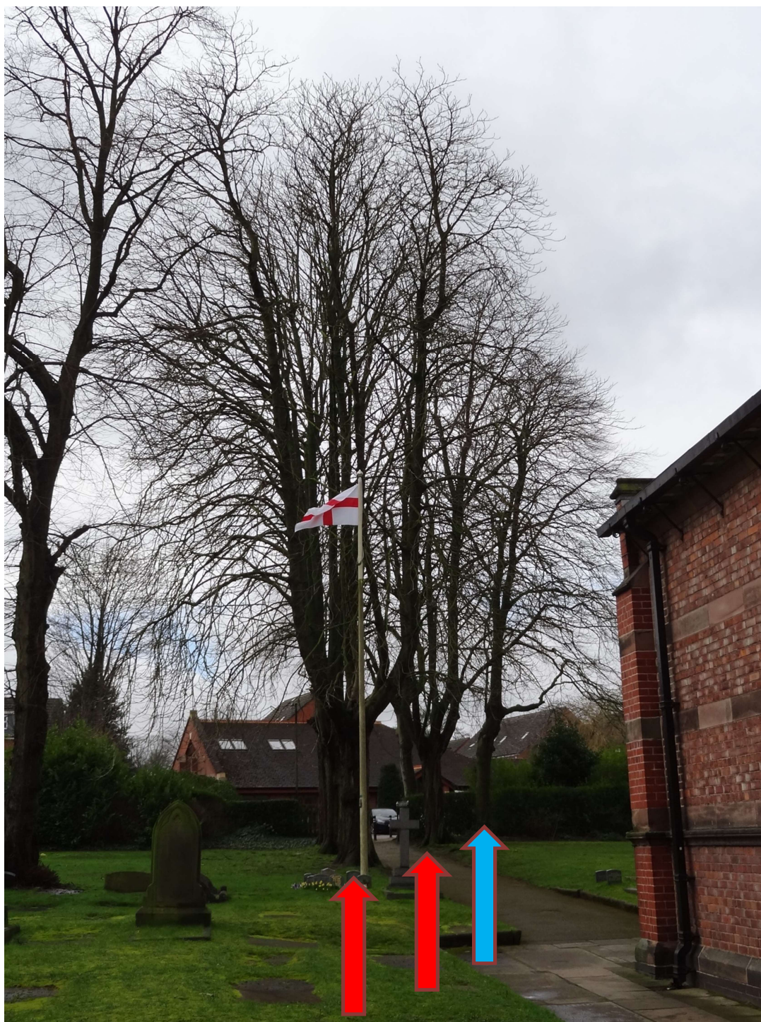
Looking West from beside the South Aisle, with the Parish Centre on the Far side of Church Walk