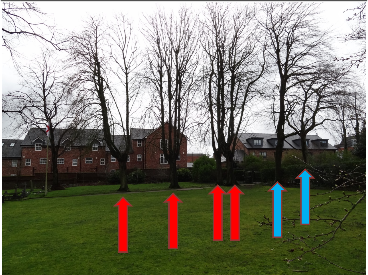
Looking South Church is to the Left; Parish Centre to the Right