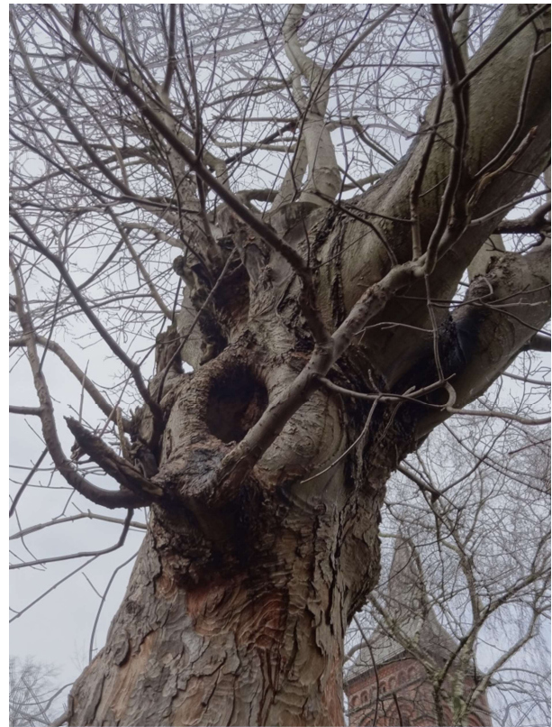
Sycamore Tree (T9)