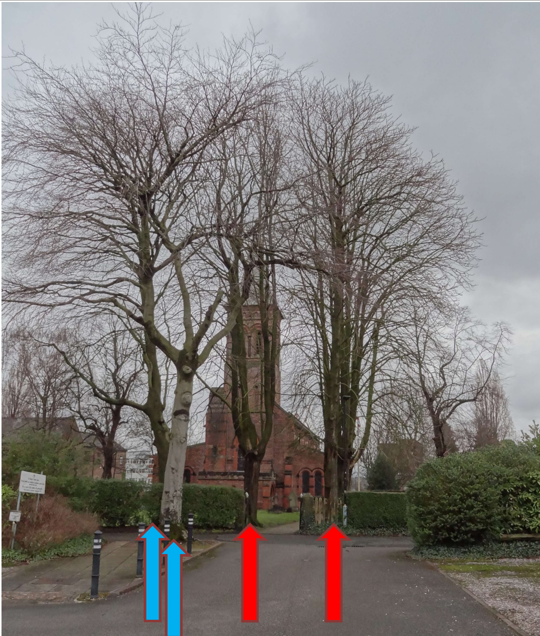
Looking East, across Church Walk Beech Trees T1 (in grounds of Parish Centre) & T2 (behind in Churchyard) Church Walk is Conservation Area Boundary, so (T1) is not in CA.