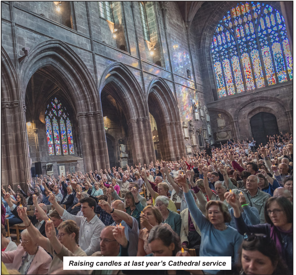
Raising candles at last year's Cathedral service